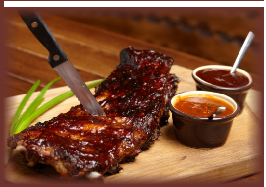
SP53 - New Leaf Smokehouse BBQ Ribs