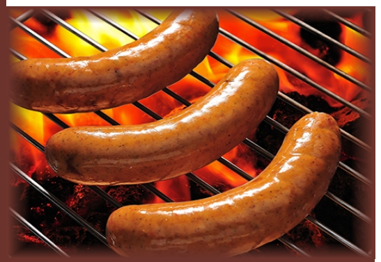
14050 - Dempseys Sausages