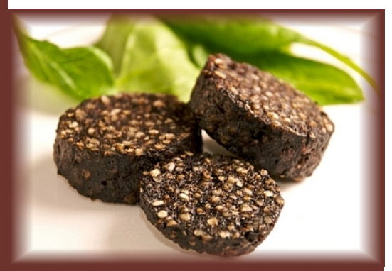
75003 - Black Pudding Slices